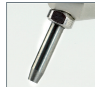
DENTO-PREP™ Spray Tip

DENTO-PREP™ is covered by a 1-year material and construction guarantee with the exception of the spray tip. DENTO-PREP is engraved with a 10-digit serial number of which the first 4 digits indicates year and month: YYMM.