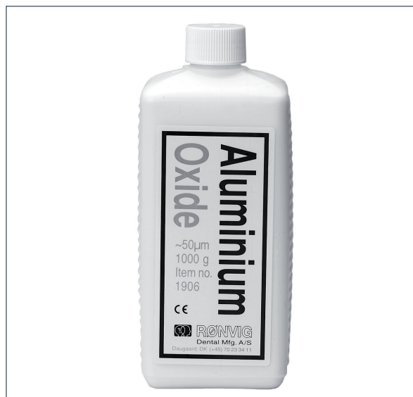
1 Kg Aluminium Oxide 50 µm. Item No. 1906

DUST-CABINET is covered by a 1 year material and construction guarantee.