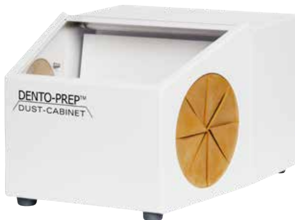
DENTO-PREP™ DUST-CABINET Art. No. 1905

DUST-CABINET is covered by a 2-year material and construction guarantee.