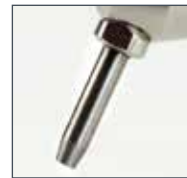
DENTO-PREP™ Spray Tip

DENTO-PREP™ is covered by a 2-year material and construction guarantee with the exception of the spray tip. DENTO-PREP is engraved with a 9-digit LOT number of which the first 4 digits indicates year and month: YYMM.