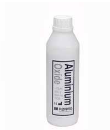
900g Aluminium Oxide 50 µm. Art. No. 1906