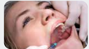
REGIONAL NERVE BLOCK